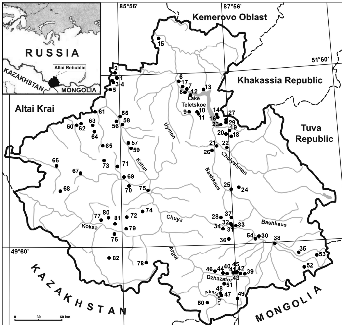
Fig. 1. Map of the Altai Republic with points of aphid sampling (numbers as in the text). Рис. 1. Карта Республики Алтай с точками сбора материала (номера приведены в тексте).