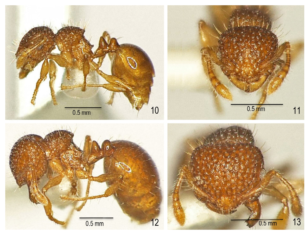
Figs 10–13. Pristomyrmex sinbaraja sp.n. (10, 11 — small worker, holotype; 12, 13 — large worker, paratype): 10, 12 — habitus, lateral view; 11, 13 — head, frontal view.

Рис. 10—13. Pristomyrmex sinharaja sp.n. (10, 11 — маленький рабочий, голотип; 12, 13 — большой рабочий, паратип): 10, 12 — габитус сбоку; 11, 13 — голова спереди.