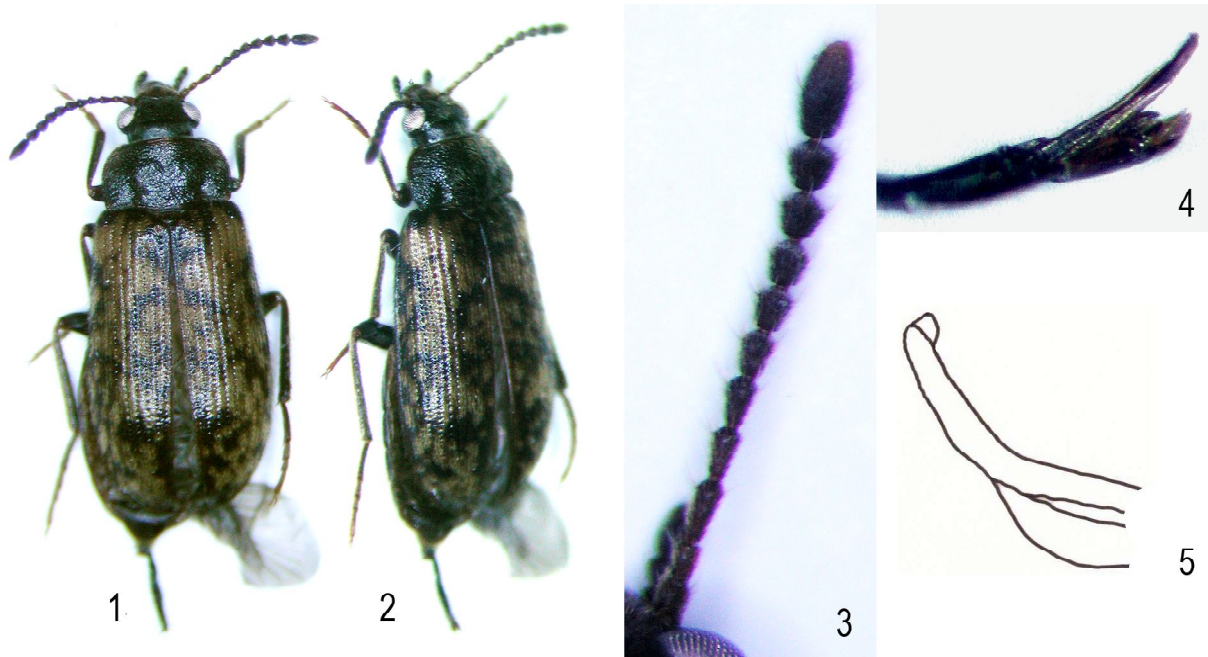
Figs 1–5. Mycetophagus (Ilendus) yunnanus sp.n.: 1 — habitus, dorsal aspect; 2 — habitus, lateral aspect; 3 — antennae; 4 — male genitalia, dorso-lateral aspect; 5 — male genitalia, tip of median lobe, lateral aspect.