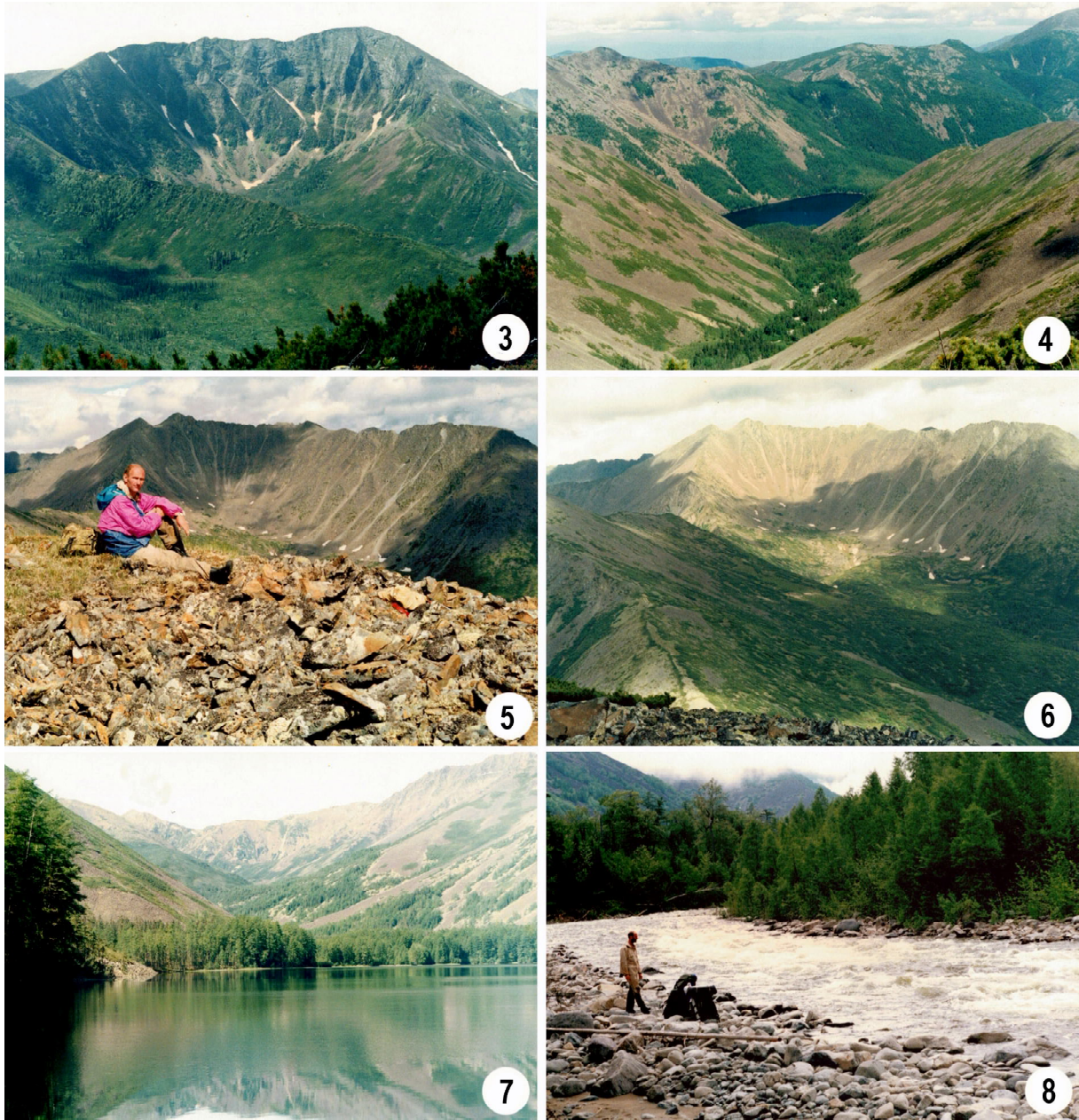
Figs 3–8. Habitats of Carabidae in Badzhal range. 3 — The source of the Omot River; 4 — View of the Lake Omot from the watershed of the Omot and Omot-Makit rivers; 5 — Placer stones in the foreground — the habitat of Pterostichus orion , Pt. longipes and Pt. (Cryobius) sp. 4; 6 — View of the Ulun Mt., 2221 m alt.; 7 — The Lake Omot; 8 — The Gerbi River in the middle reaches.

Рис. 3–8. Местообитания жужилиц Баджальского хребта. 3 — Исток р. Омот-Макит; 4 — вид на оз. Омот с водораздела рек Омот и Омот-Макит; 5 — каменные россыпи на переднем плане — биотоп Pterostichus orion , Pt. longipes and Pt. (Cryobius) sp. 4; 6 — вид на гору Улун, 2221 м н.у.м.; 7 — оз. Омот; 8 — р. Герби в среднем течении.